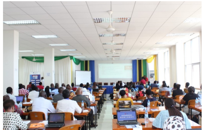
COTUL workshop training on discovering e-resources through the Research4Life Programme

The main challenges that are facing many registered institutions include unreliable internet connection and low awareness of how to access and use the Research4Life programme.