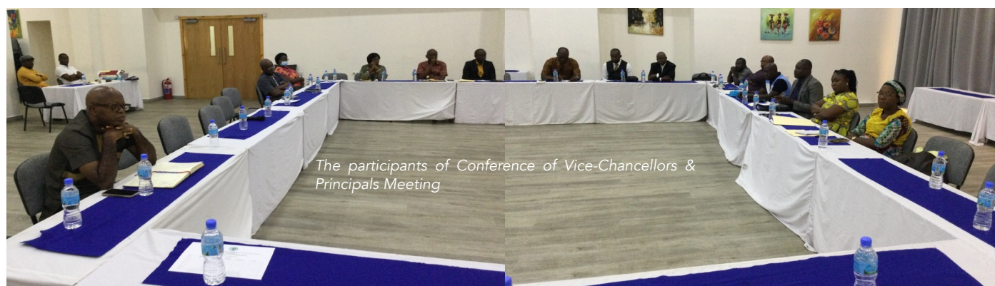
The participants of Conference of Vice-Chancellors & Principals Meeting

At IPAM, University of Sierra Leone, Country Connectors have been able to train two new staff who joined this year and registered for the Research 4Life MOOC 7th ed. Master Course. Three ambassadors completed the course and were awarded certificates.