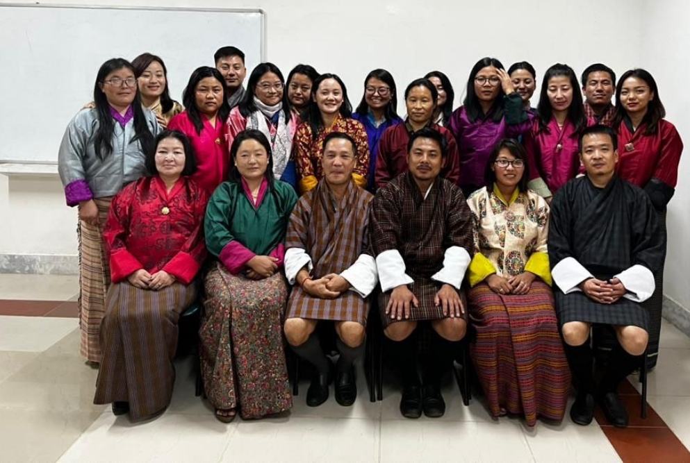
Research4Life Workshop 2022: College of Science and Technology, Phuentsholing, Bhutan

The development of the Country Communications Plan was accomplished with