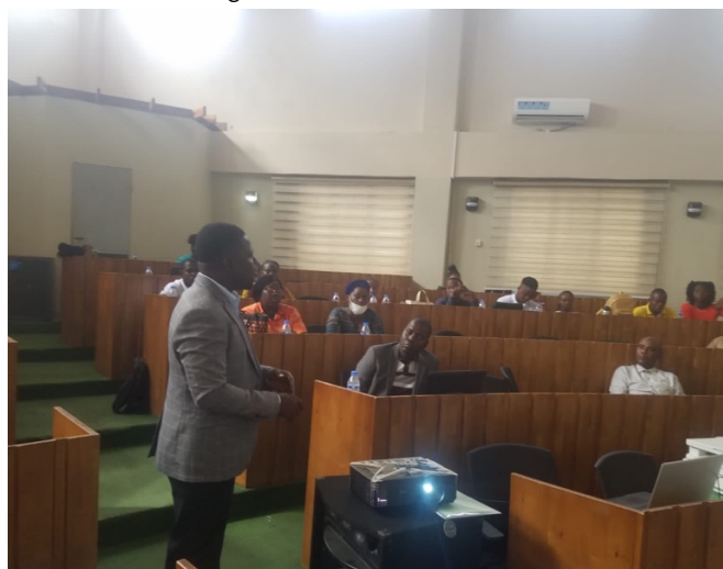
Research4Life Training 2022, Liberia