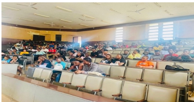
The participants of R4L awareness training Workshop, Njala University Auditorium

As part of the drive to promote Research4Life in the University of Njala, in November 2022, Deans and Heads of academic departments were invited to attend the Research4Life awareness training workshop. The participants were introduced to the content portals to access evidence-based resources for curriculum development. The Research4Life training account was used for the participants to access the content portals, as many participants did not know their institutions' login credentials. The Deans and heads of department now play a significant role in promoting Research4Life in their respective institutions/organizations. They have since reported that advocacy programmes and training on access to the content portals were conducted for their users, especially for postgraduate students.